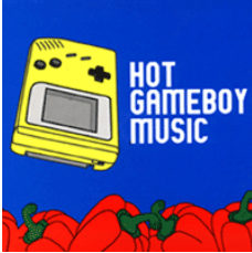
Hot Gameboy Music plagdichnicht, 2003