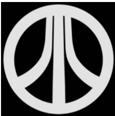
Wanna hld Yr Handheld (Sampler, Vol. 2) 8bit Operators, 2011